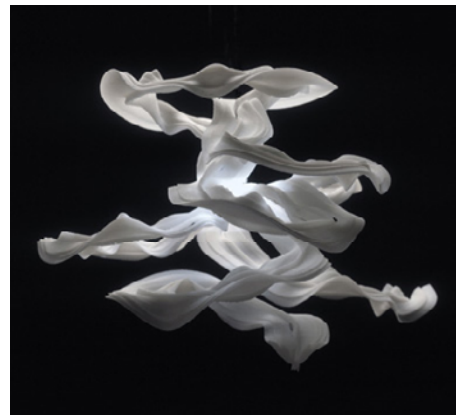
Fig. 4. Attracted to light Narrates the erratic trajectory of a moth upon seeing a light source. 250 mm x 300 mm x 350 mm Mfr. Nylon.

These figures explore the materialisation of motion's unseen metaphysical change. The Long Exposure series depicts the unseen trace-echo of a bird or moths' flight path. Through utilising cinematography technology to capture the intermediary phases of the subjects' trajectory; a continual sinuous passage within time and space is contextualized through motion engendering form . These kinematographical sculptures reconstruct pure sensation in objective terms, through synthesising the temporal processes of movement. Materialised through rapid-prototyping technology these apparitions create a unique haptic experience.