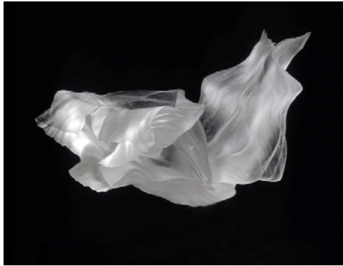
Fig. 1. Flight – Landing The translucent nature of glass exemplifies the ephemeral nature of motion. 650 mm x 350 mm x 400 mm Mfr. Cast Optical Glass.

Received 31 January 2007 and Revised 26 April 2007