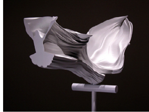
Fig. 2. Flight – Landing Materializes the solid echo of a birds flight pattern. 650 mm x 350 mm x 400 mm Mfr. Z-corp.